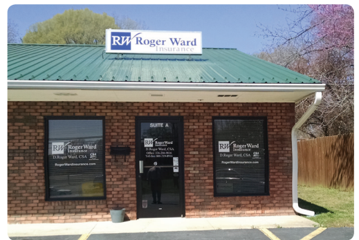
307 W Meadow Rd, Suite A, in Eden

Thank you again for allowing us to help you with your insurance needs. We wish you a Merry Christmas and a happy and blessed New Year and all through 2019!