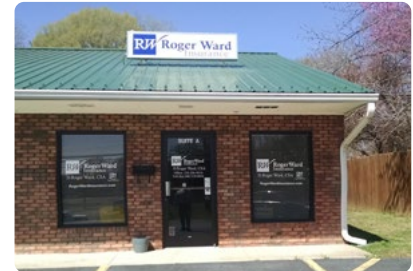
307 W. Meadow Rd Suite A, in Eden, NC